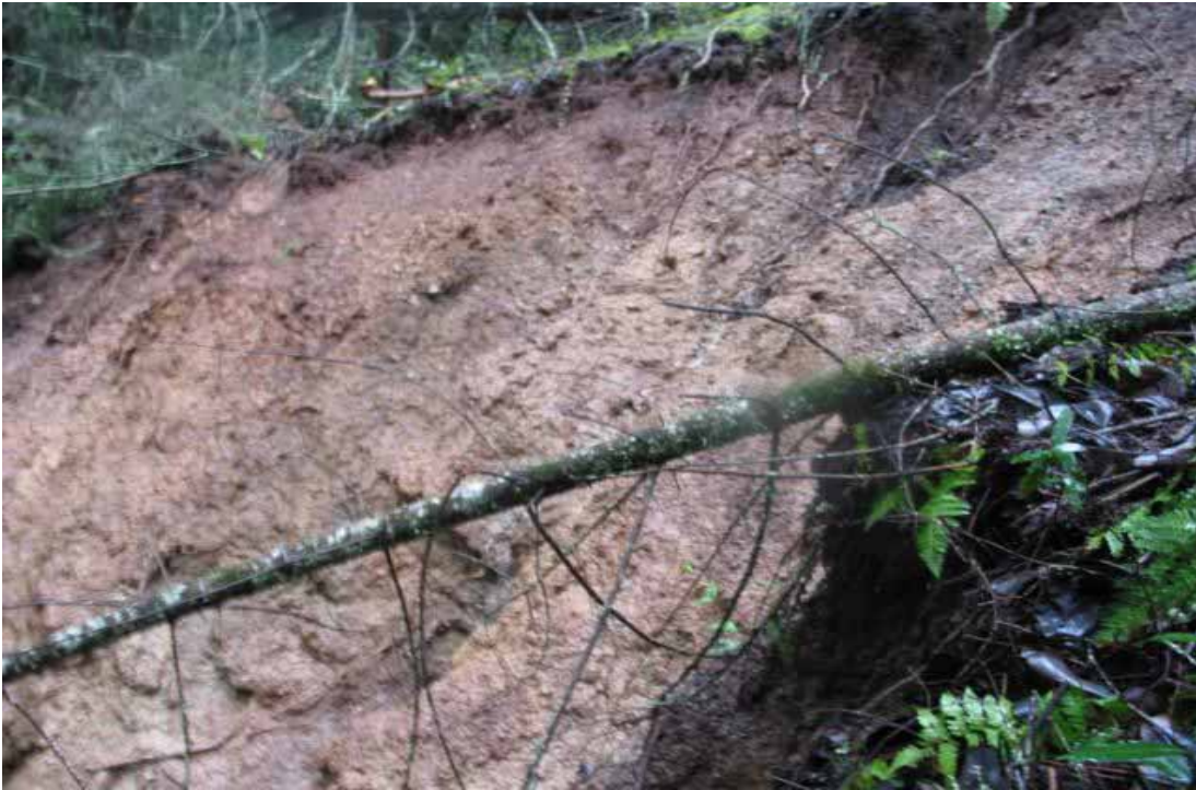
Exhibit K1 – Landslide below Cornell’s graded area, close to proposed winery site (2006)