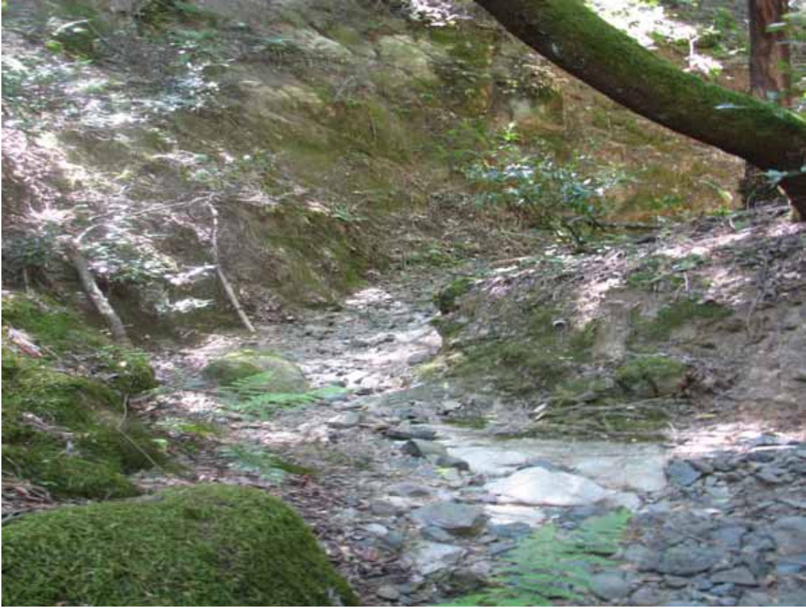
Exhibit G – Dry creek bed directly below proposed winery site.