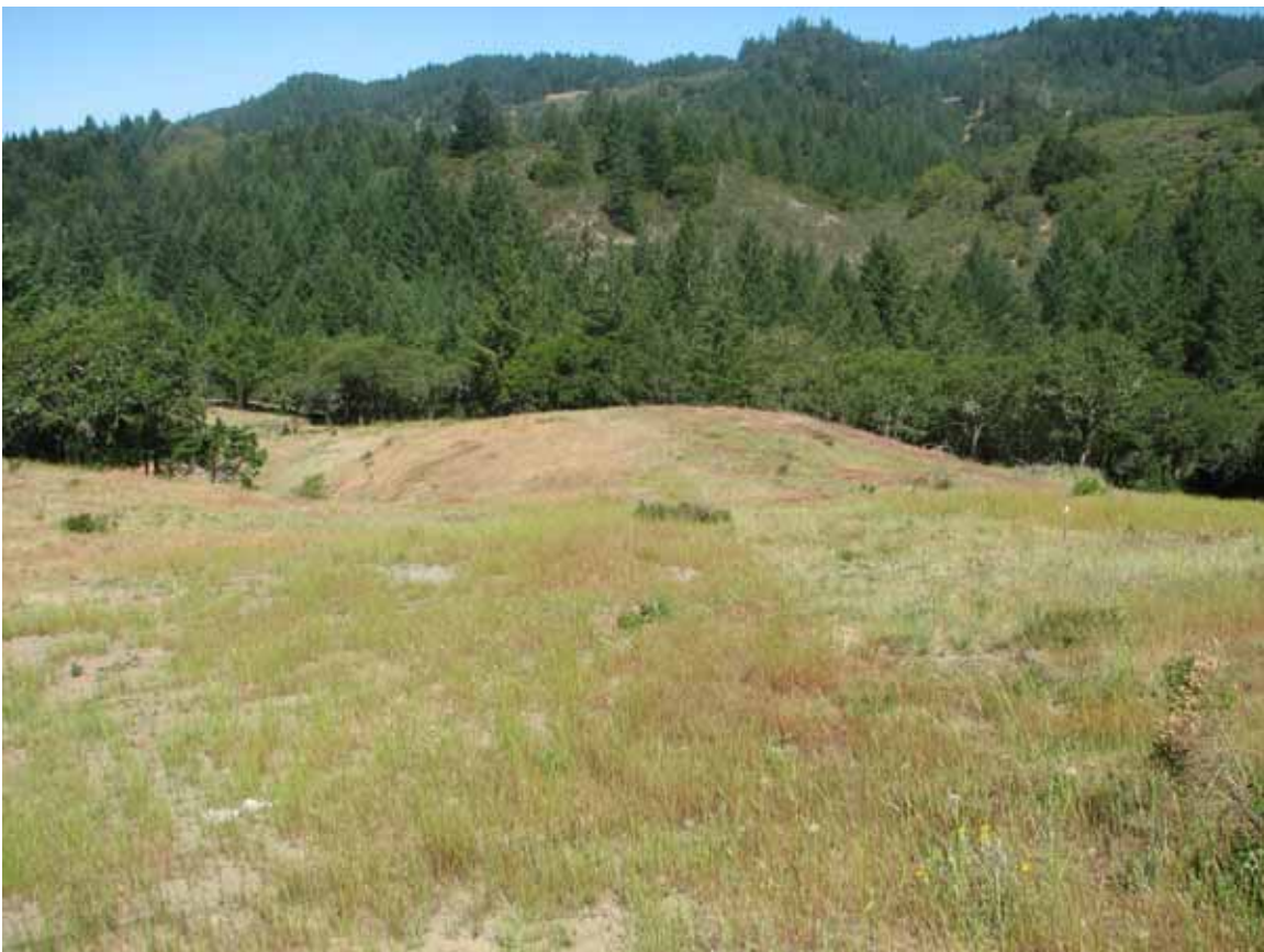
Exhibit J1 – As the site looks today in 2008.