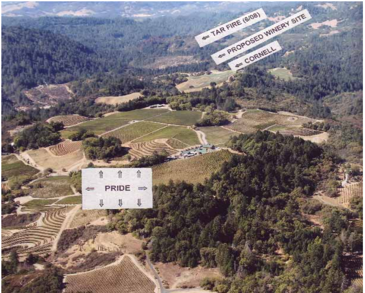
Exhibit D – Aerial photo of Pride Vineyards & Cornell & proposed winery site.