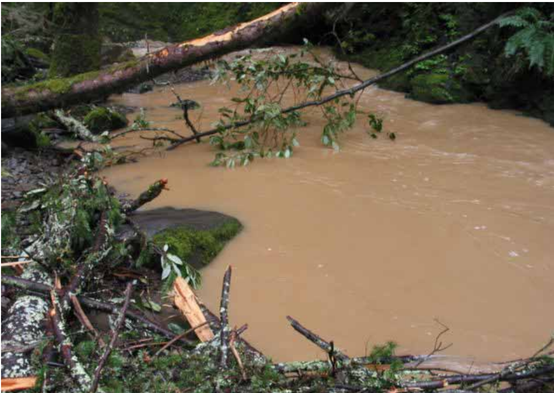
Exhibit K2 – Sediment entering Mark West Creek after landslide