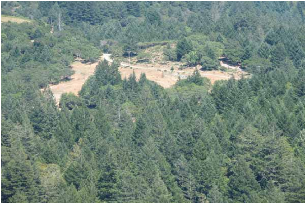
Exhibit J4 – Photo of proposed winery site from neighbor's.