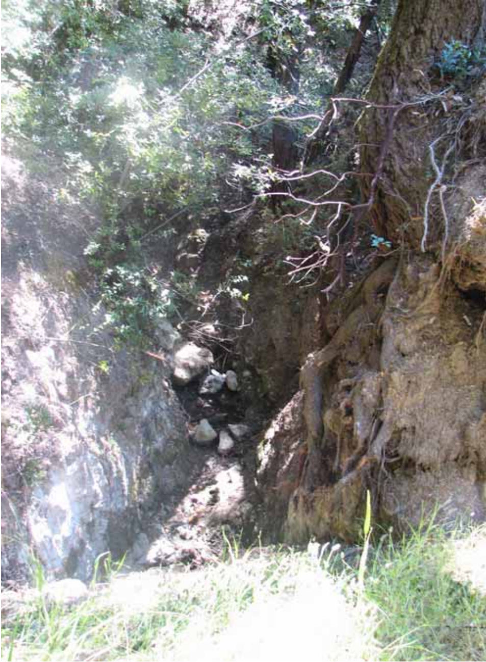
Exhibit L – Photo of edge of slide adjacent to proposed winery site