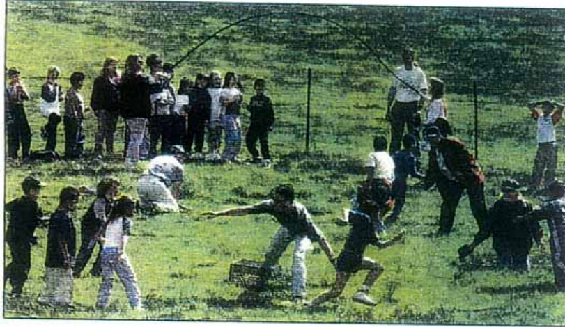
Lessons in Life: Third graders from Fremont School play "salmon," a game that mim- ics the life cycle of the fish.

"We're trying to instill an appreciation for the world around them."