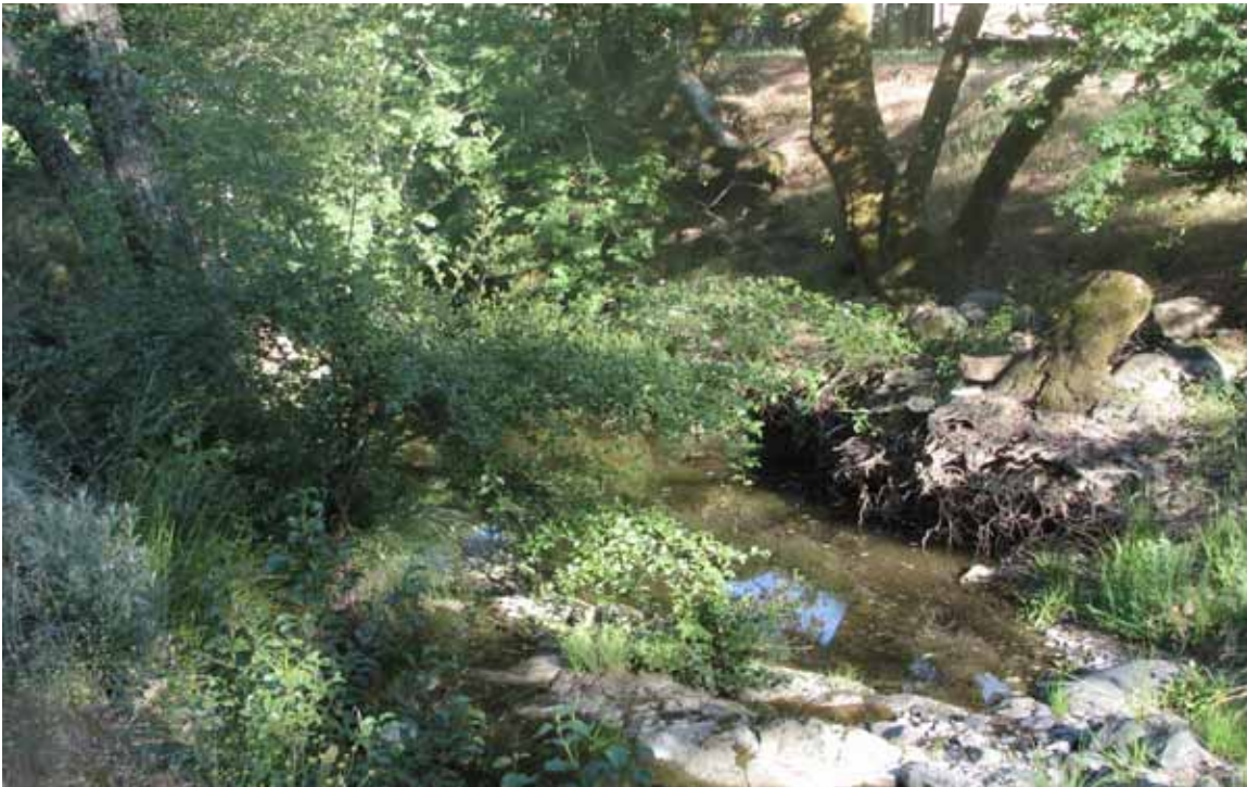
Exhibit H – Shows erosion along my streambanks in Mark West Creek