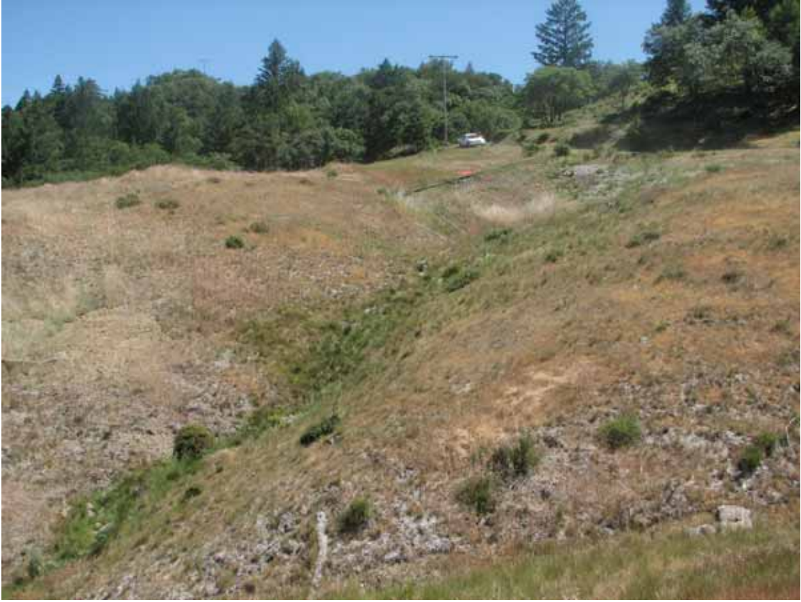
Exhibit J6 – Cleared proposed winery site adjacent to Wappo Road.