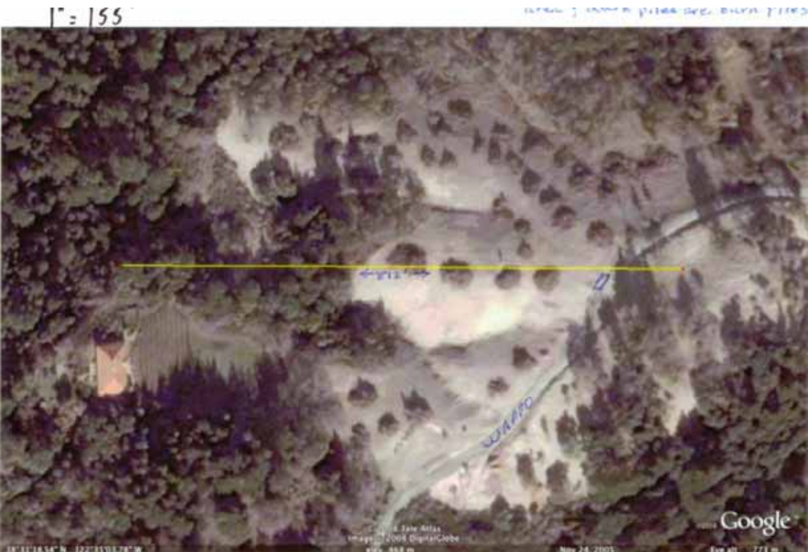
Exhibit J3 – Google Earth shows over 30 such piles of wood (Nov. 2005)