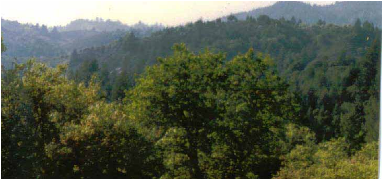
Exhibit J1 – As the proposed winery site looked in 1988.