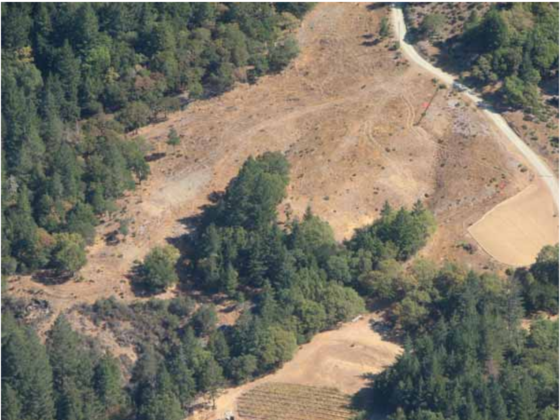
Exhibit J5 – Cleared proposed winery site from the air. Note new grading at right.