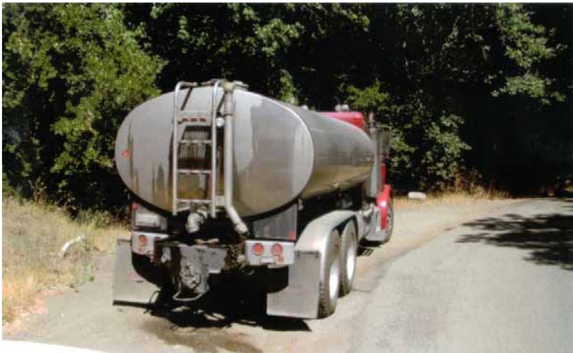
Exhibit E – Water truck hauling to Pride Vineyards (July 21, 2008). The driver stated that they had been hauling to Pride since May 2008.