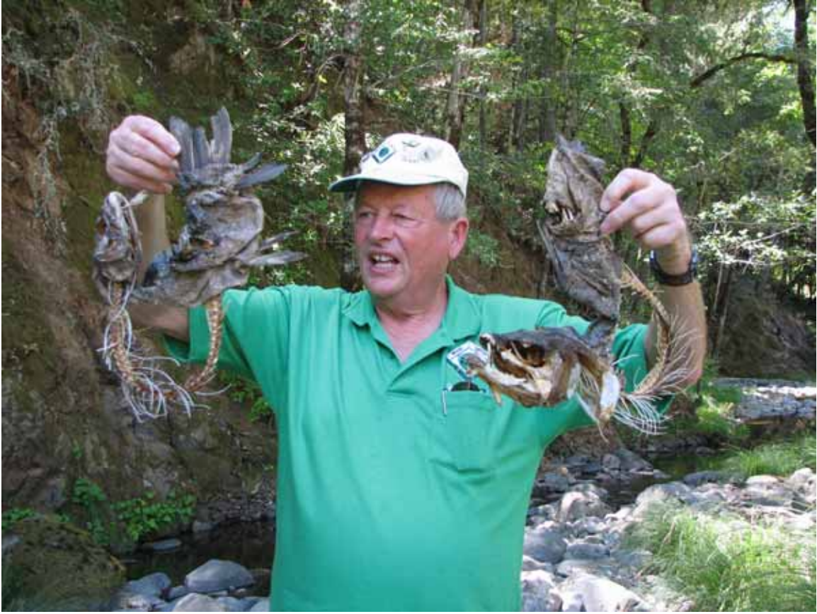
Exhibit I – Steelhead eaten by vultures in Mark West Creek because of extremely low water level last winter (07/08).