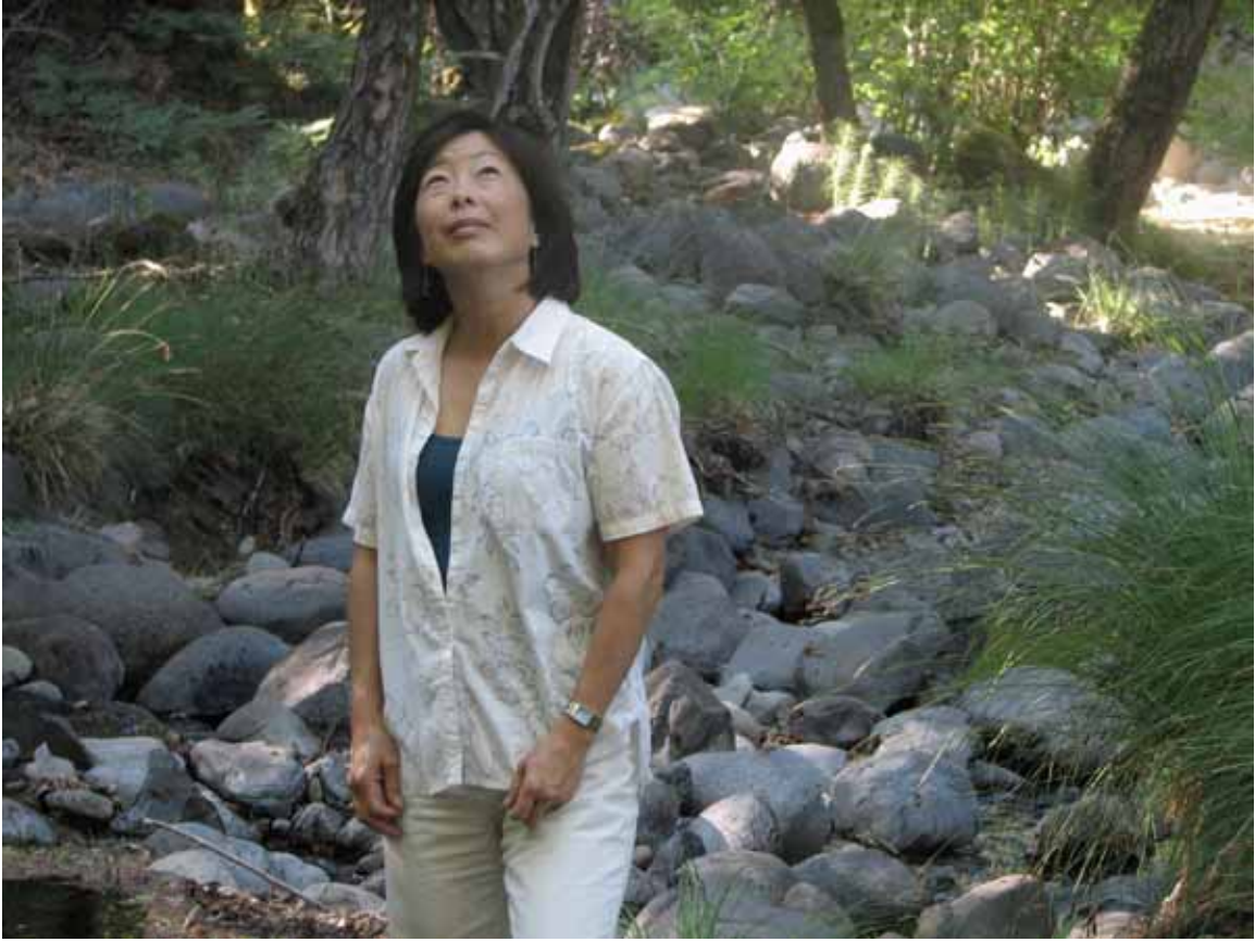
EXHIBIT F2 – Photo taken on Mark West Creek taken summer 2008 at same location as photo taken by Press Democrat in Exhibit F1 .