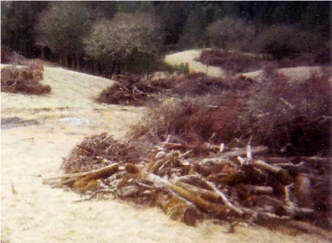
Exhibit J2 – Proposed winery site being grubbed showing larger trees.